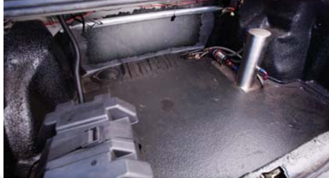
The fuel system is quite simple and straightforward with a Walbro lift pump pulling fuel into the surge tank which then spits into the fuel lines via a single Bosch 044 fuel pump