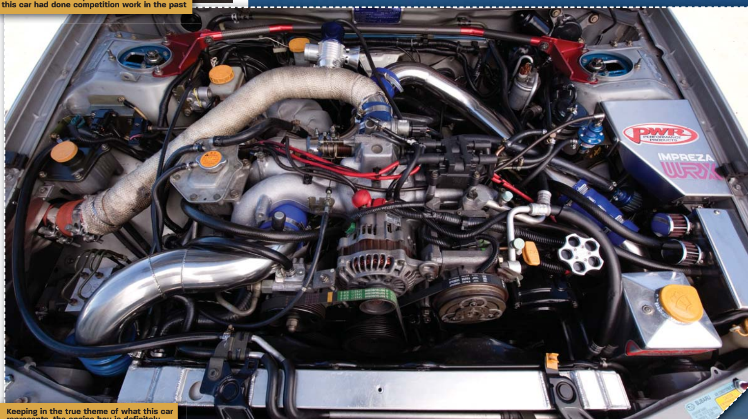
Keeping in the true theme of what this car represents, the engine bay is definitely kept functional more than it is kept formal

When it was picked up by Richard, it already contained a PPG dog cut box and Alcon front brakes. The dog box received a much needed freshen up and "The standard rear brakes were costing me time at the track so I had them upgraded to Brembo callipers," Richard explains.